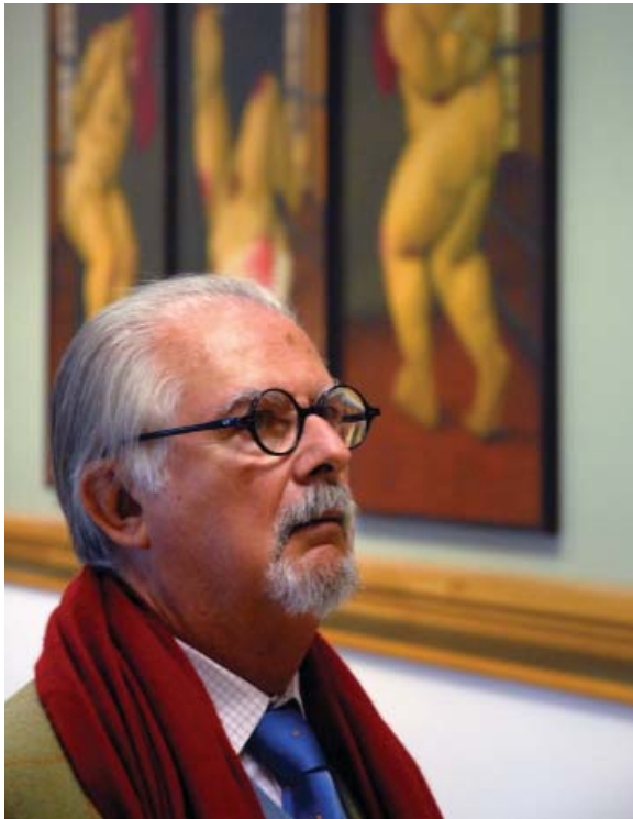
Fernando Botero brought his "Abu Ghraib" exhibit to CLAS in spring 2007.