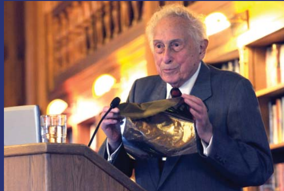
Stan Ovshinsky, the “Einstein of Alternative Energy,” spoke on renewable energy and the Americas in spring 2008.

Center for Latin American Studies University of California, Berkeley 2334 Bowditch Street #2312 Berkeley, CA 94720 tel 510 642 2088 fax 510 642 3260