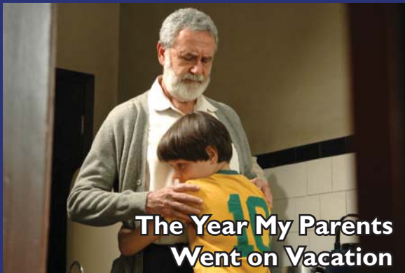
Cine Latino , a vibrant series of films from and about Latin America, has brought directors such as Walter Salles and their movies to Berkeley.